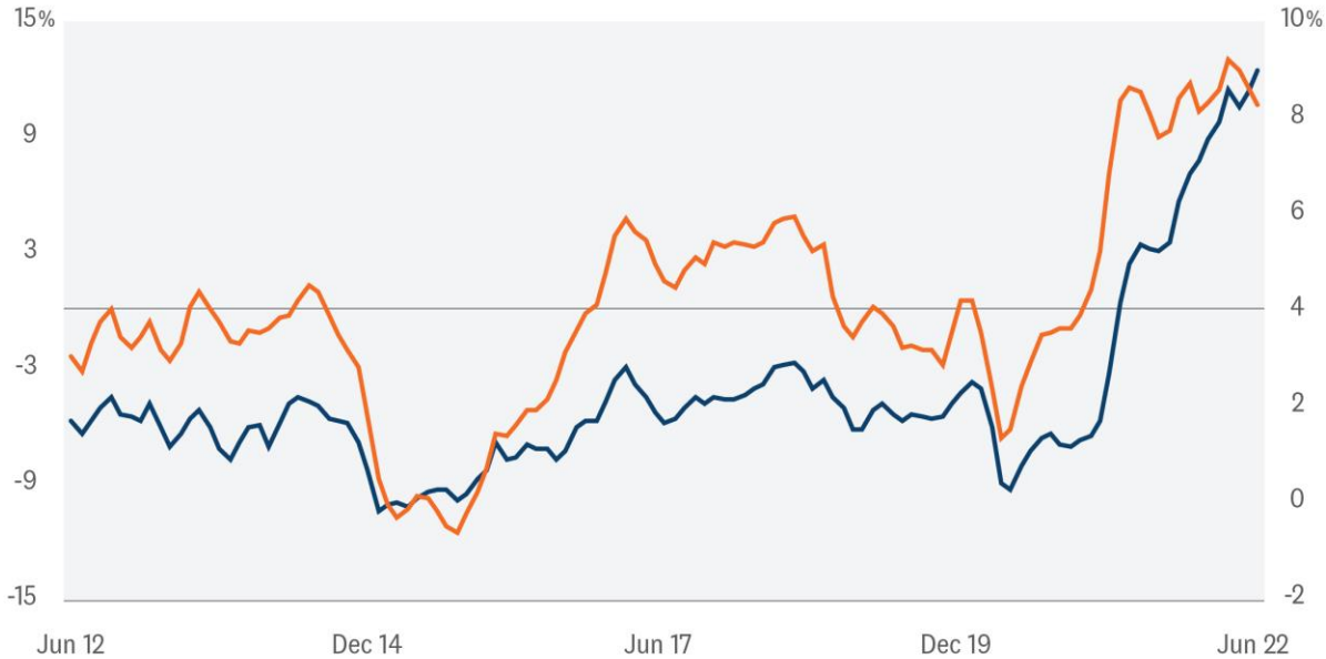
Source: LPL Research, U.S. Bureau of Labor Statistics 07/25/22 Estimates may not develop as predicted.

● Right Axis: CPI, Y/Y % ● Left Axis: Import Prices, Y/Y%